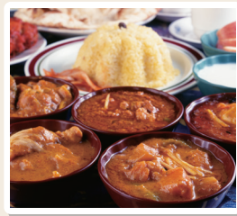
at a curry restaurant