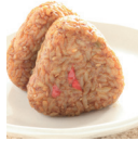
curry rice balls