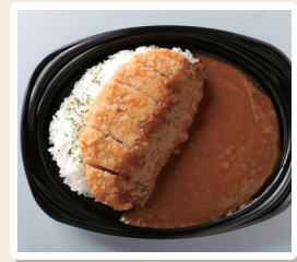
at a convenience store